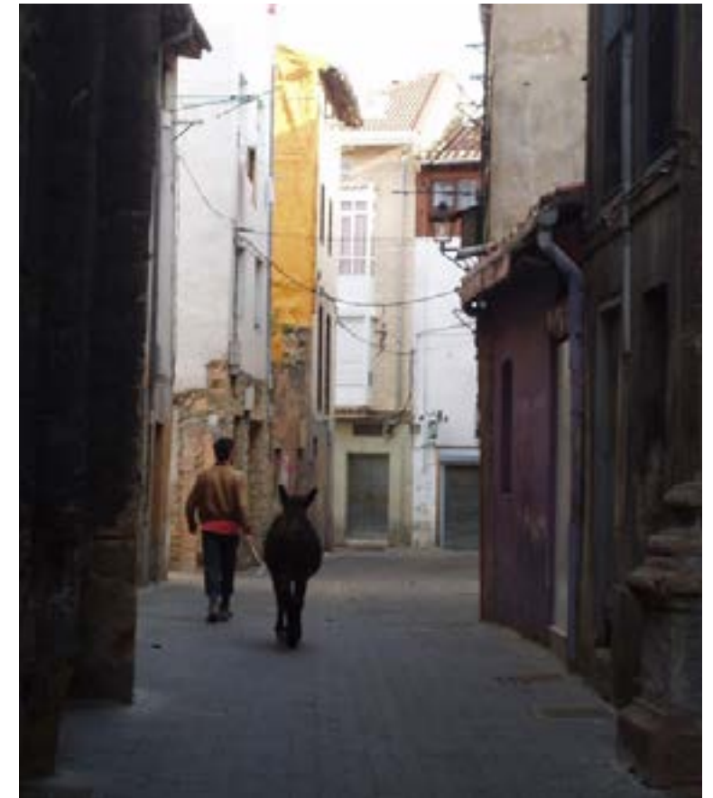
Riding Tikki, 2005 Miranda de Ebro 2005

Ambulation with a donkey in Castilian city which served as a concentration camp for the International Brigades in the Francoist dictatorship. This animal has gradually disappeared from the region, having served the dirty work of the Spanish Civil War.