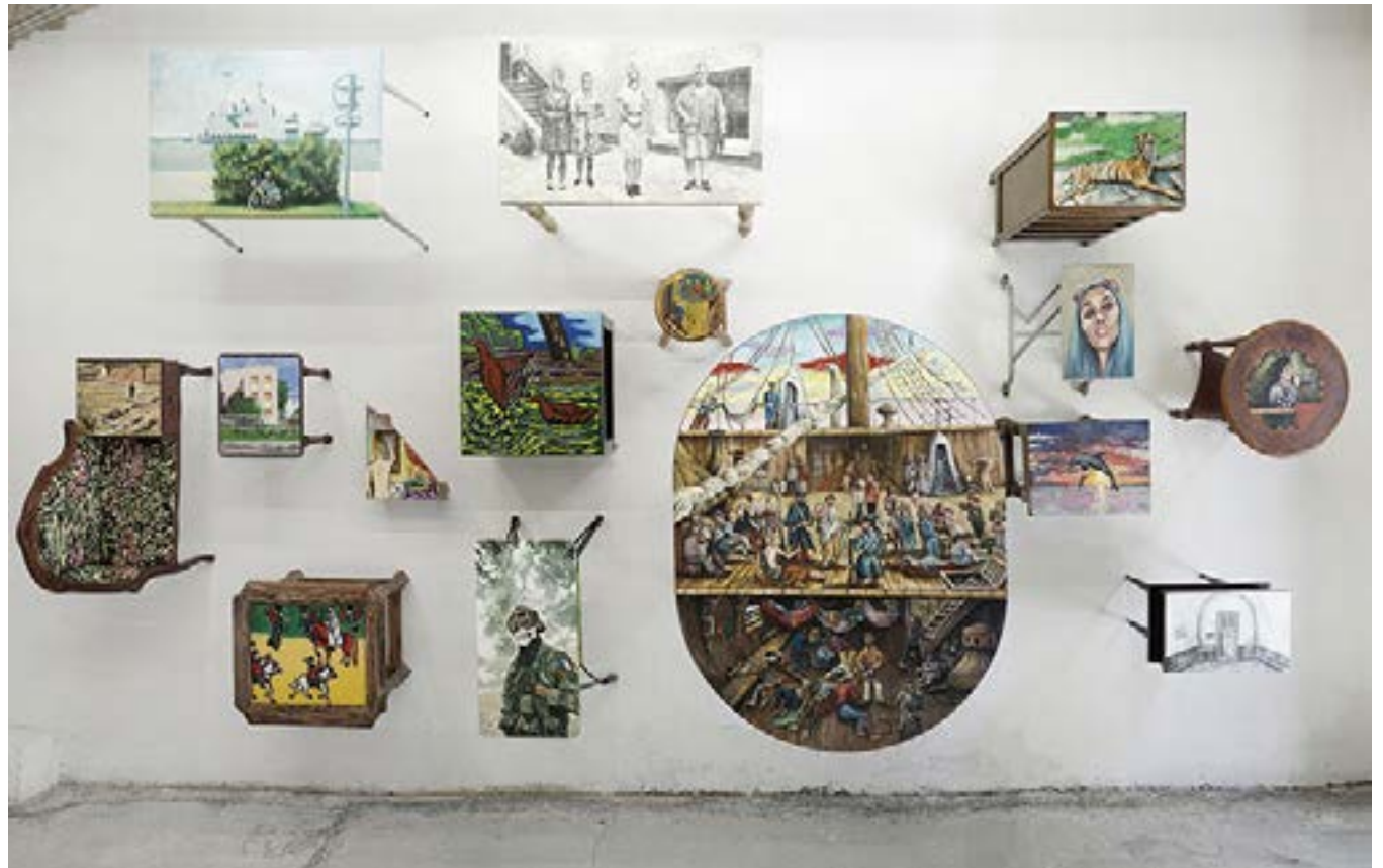
FRANCHE TOUCHE, 2018 Installation, paintings, furniture Bruit de Fond - Marseille 2018