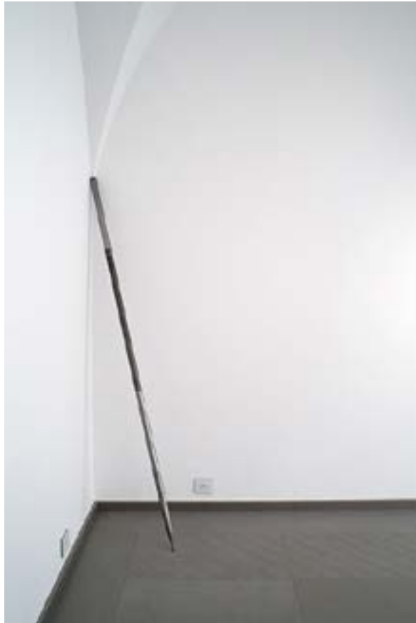
Drapeau négatif 2014