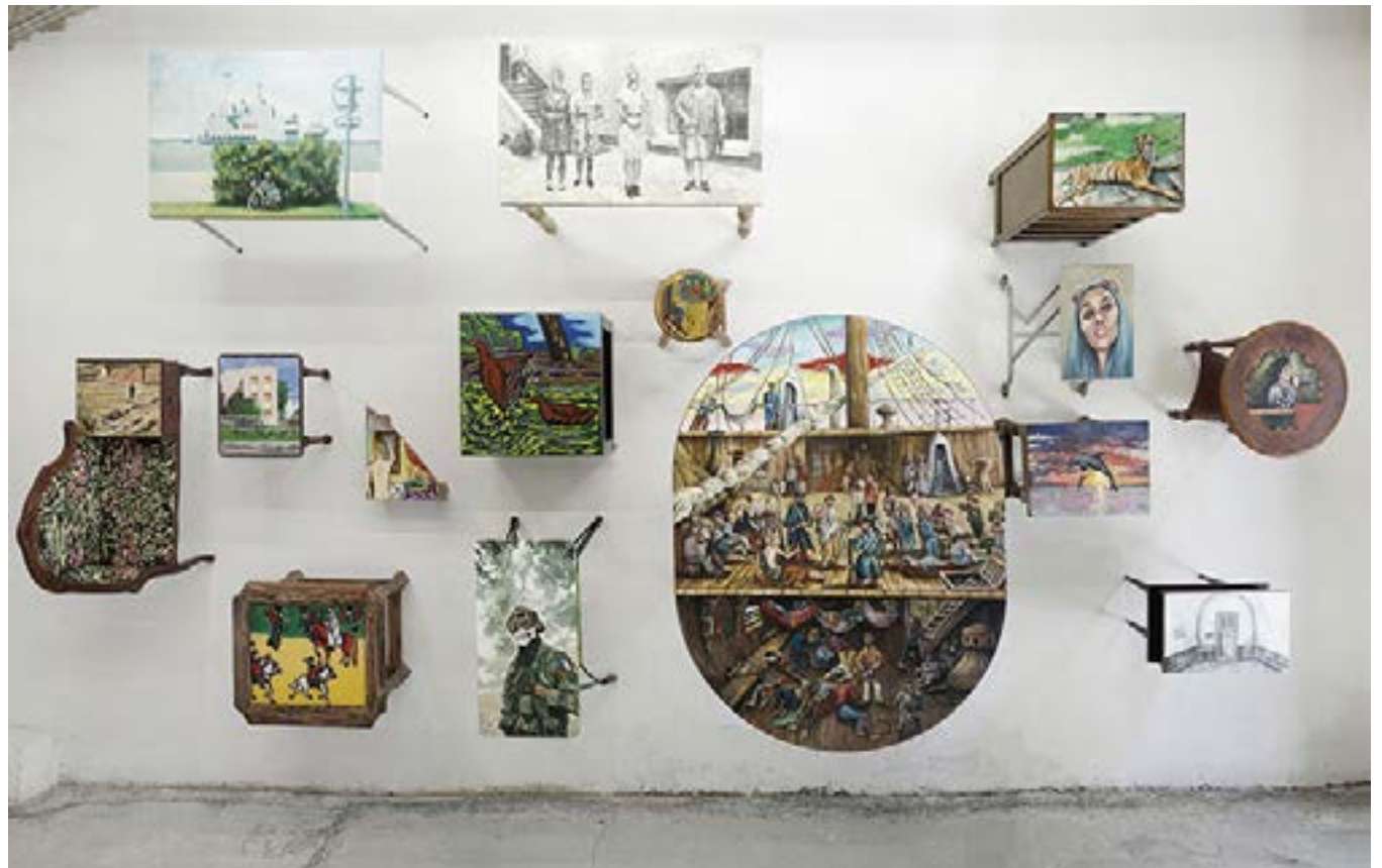
FRANCHE TOUCHE, 2018 Installation, paintings, furniture Bruit de Fond - Marseille 2018