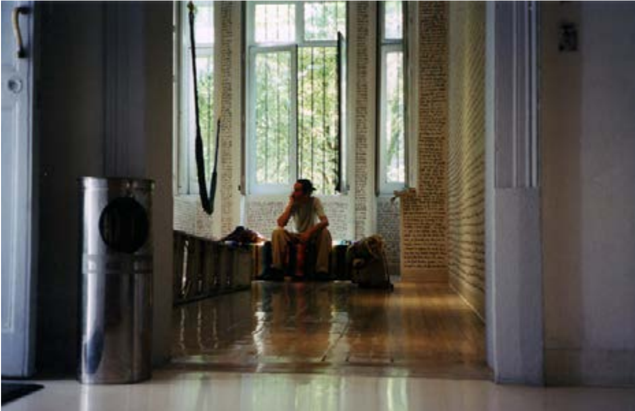
Habitacion uno, 2003

Be hosted in a gallery. Writing a logbook on the walls.