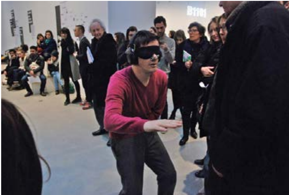
Sans Tête, 2016

Performance art, Young Creation, Thaddaeus Ropac Gallery